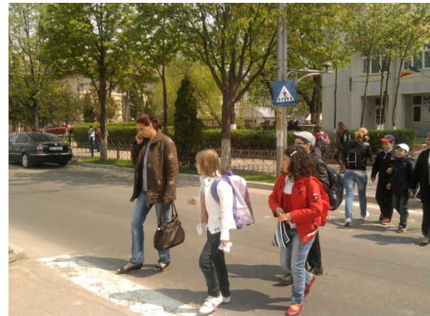
Photos of the site before treatment.