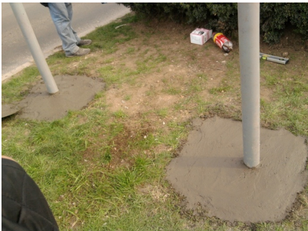
Anchoring into the ground