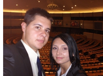
Photo of the team