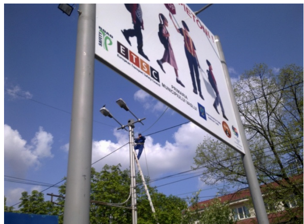
Connection to public lighting