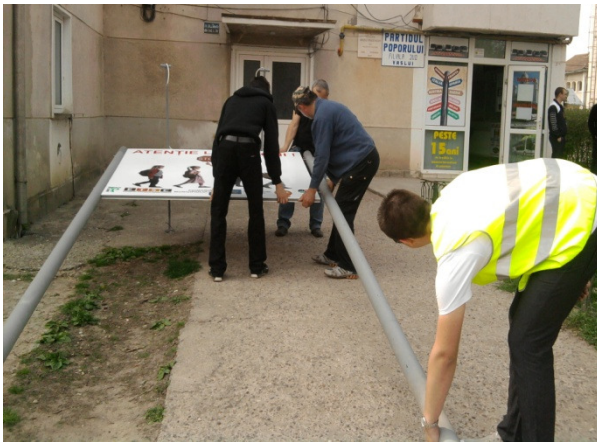
Mounting of the display