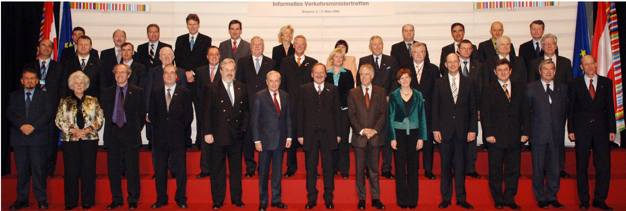
EU Transport Ministers at the Informal Council on Road Safety, Bregenz/Austria 2006

With this first Road Safety PIN Flash, ETSC is launching a new series of publications linked to its new Road Safety Performance Index (PIN). This series will highlight the important differences between European countries in what level of road safety they afford their citizens. Each Flash will bring into the spotlight a specific field in road safety and compare countries' performances in this area. The best countries' experiences will be discussed in more detail.