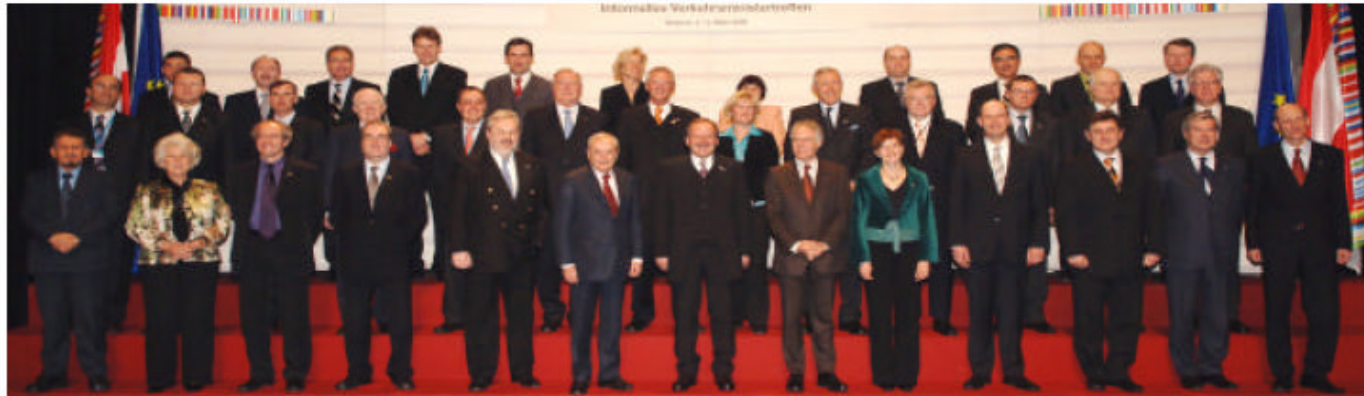
EU Transport Ministers at the informal meeting on road safety, Bregenz, March 2006