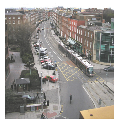
P.Rio Branco - ETSC

The National Roads Authority prepared guidelines on Road Safety Audits in 2004. The guidelines cover the requirements Road Safety Audits on national road schemes. Up to the end of 2004, 124 traffic calming schemes have been installed in towns and villages